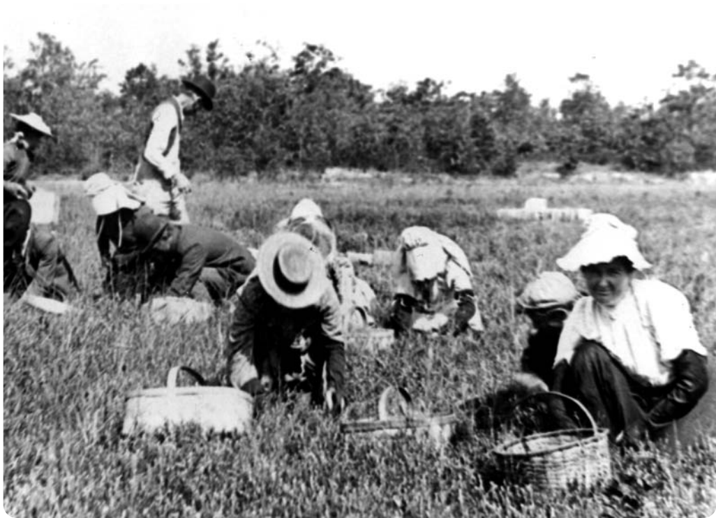
Picking in the Pines.